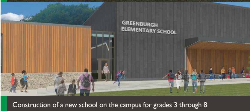
Construction of a new school on the campus for grades 3 through 8