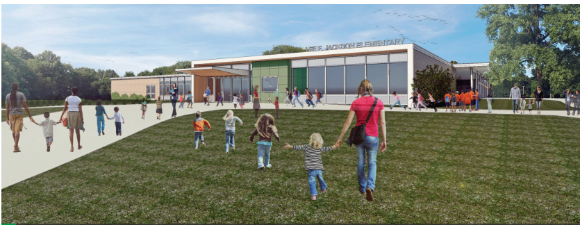
Renovation and expansion of Jackson Elementary to serve pre-K through grade 2